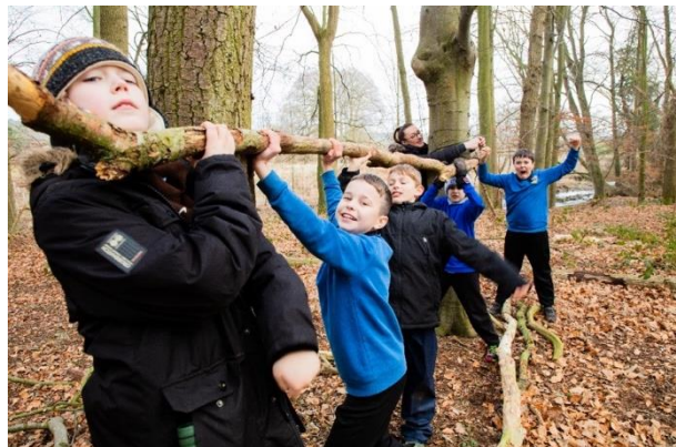
Pupils from Newbrough C of E Primary school participating in Forest School lessons through their NTCA 'Inspire' grant.

We funded 12 schools to develop bespoke education recovery projects to the benefit of 2,000 children most in need. Priorities addressed included oracy and literacy, re-engaging whole school communities, mental health, and outdoor learning. A School Mental Health Award has also been launched with 70 schools having signed up since January 2023.